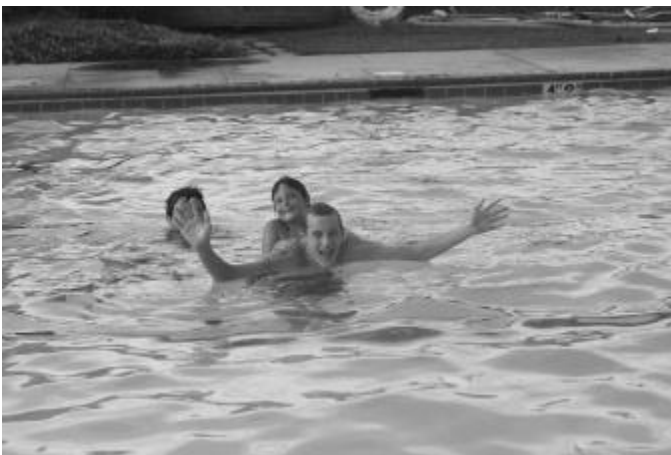
← Ride 'em, cowgirl!