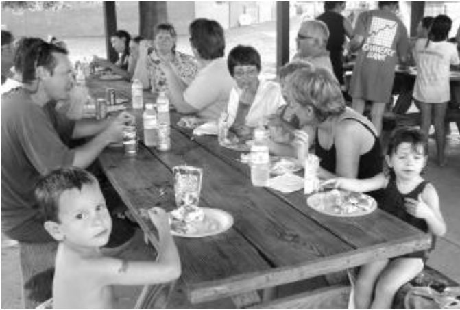
← Enjoying subs under the picnic shelter