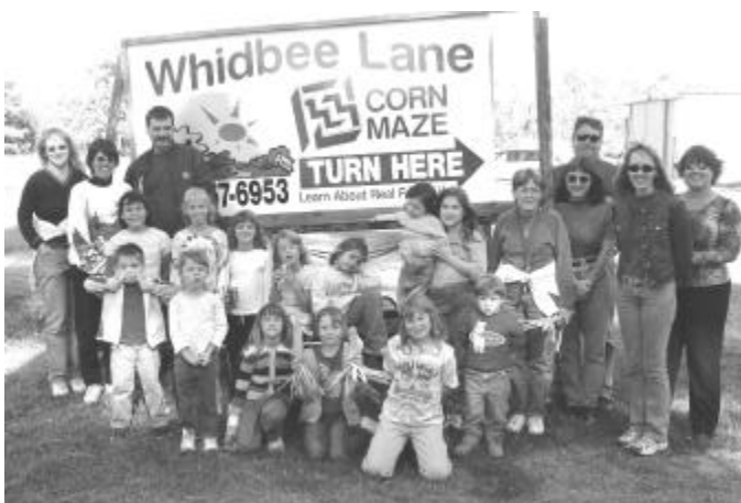
The Pioneer Clubs had a great time at Whidbee Lane Farm!

Special thanks to all the Pioneer Clubs leaders and parents who helped drive the children to the farm and supervise them while there.