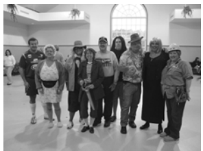
The older children and adults compete in the Costume Contest

Throughout the Festival, a Cake Walk was held in Graham Hall, and over 40 people won delicious cakes baked by members of the congregation.