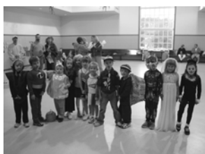
Left to right, the infants and young children show off their costumes