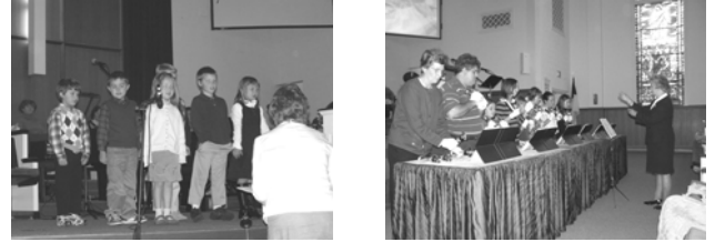
Left to right, the Carol Choir and Junior Handbell Choir perform for Youth Sunday

performed a song during the service, and the Youth Chorus performed the popular praise song "God of Wonders". The Junior Handbell Choir also played "Ode to Joy" for the Offertory.