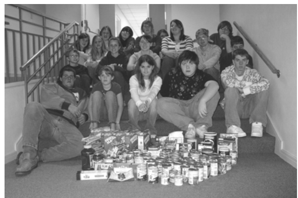
The youth with their purchases for the Food Pantry

At about 1:30pm on Saturday, the group participated in a special Tribal challenge—a Food Scavenger Hunt at Food Lion on Holland Road. Each tribe was given $20 and a scoring sheet, and were challenged to purchase as many items as they could with the amount given. Points were awarded for each item purchased, and bonus points were awarded for items that met certain criteria on their score sheets. After returning to church and determining the winners, the food items purchased were donated to Bethlehem’s Food Pantry. In total, over 100 items were donated to help needy families right here in our own community.