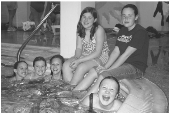
The girls relax in the indoor pool at Silver Creek