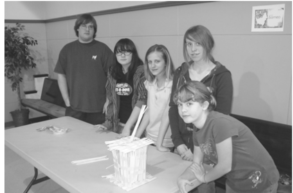
The Borneo tribe shows off its first-place shelter

1.5 million people lost their homes. The devotion for this tribal challenge was based on Matthew 6:19-21, and dealt with the topic of “storing up treasures”.