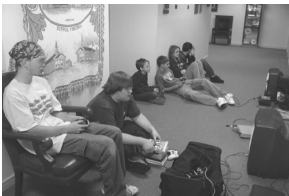
Video games were a popular way to pass the time

Between the tribal challenges, the youth watched movies, played video games, and read books to help pass the time.