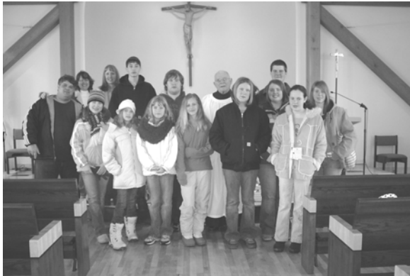
The group after the service at Saint Bernard's Chapel

Following the church service, the group returned to their rooms for an early lunch, then hit the slopes once again.