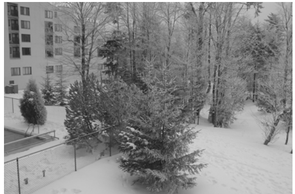
The view from our rooms at Silver Creek

The conditions at Snowshoe during our trip could not have been much better. The resort had received several feet of natural snowfall to date, with over six inches of fresh snow falling during the week prior to our arrival. The high temperatures throughout our stay were in the low 20s, with a beautiful light snowfall coming down much of the time we were there.