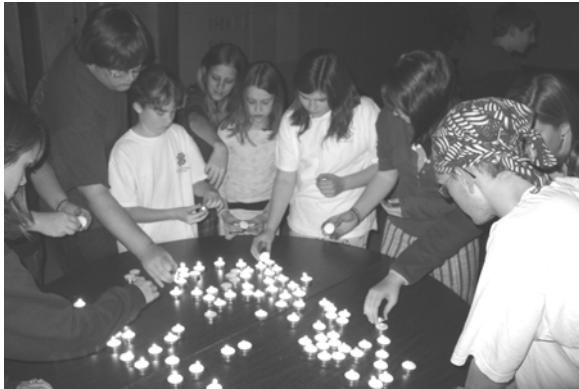
The youth help light candles for their midnight devotion