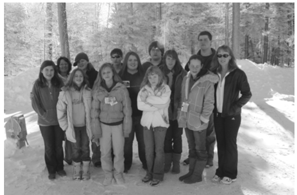
The group pauses for a picture before leaving Snowshoe