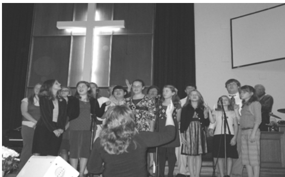
The Youth Praise Team sings the Special Music, "Lord, I Lift Your Name on High"

The Youth Praise Team began the service by leading the congregation in a number of praise songs. During the service, this group also led the congregational hymns, and sang the Special Music, the Offertory, and the Anthem.