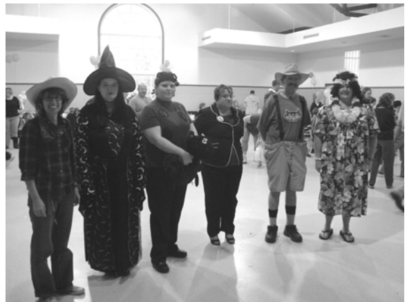
The adults enjoy dressing up, too!

This year's Harvest Festival was a huge success, with an estimated attendance of approximately 150 people. Plus, a large number of children and families from the community came out to join the fun as well.