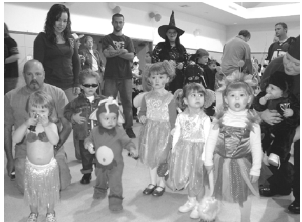
The infant through 4-year-olds show off their costumes

A Costume Contest was held, and over a dozen children and adults were awarded miniature trophies.