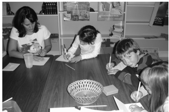
The Pathfinders write cards to the troops for Military Mail Call

For more information about your club's schedule, including any special events planned for your individual club, please see your club's leaders.